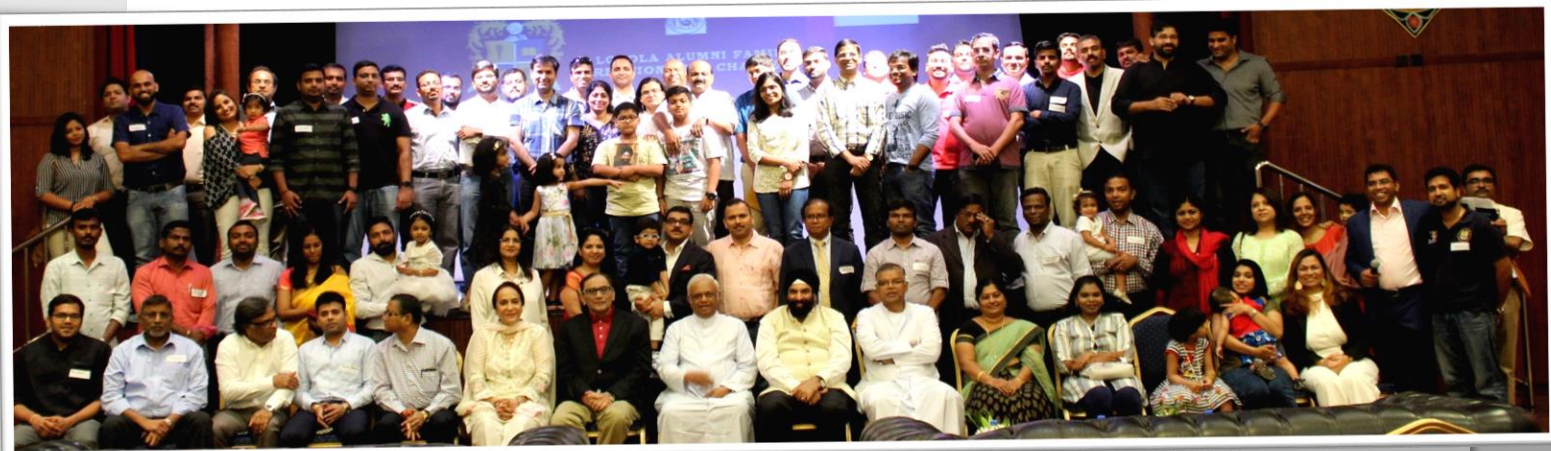
Annual meet of UAE Chapter