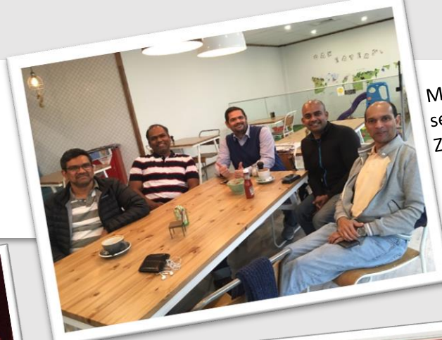
Meeting held by section of the New Zealand Chapter

At this time the New Zealand Chapter was also inaugurated.